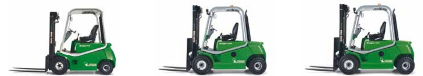
Drago 150 - 200