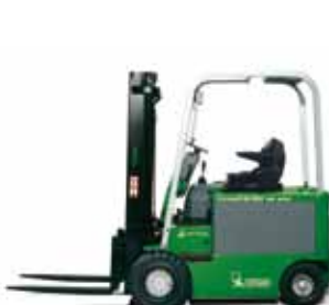
cenTAURO 80 250 - 300