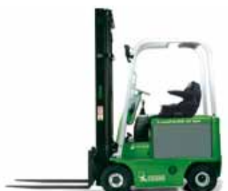
cenTAURO 48 160L - 200L