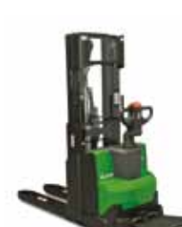
S212L - 214L