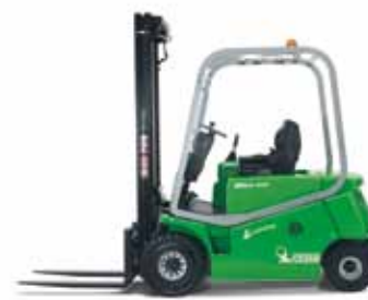
Blitz 250 - 300 - 300L - 350