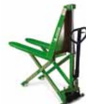
CE100HL - 100HLE