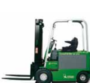
cenTAURO 80 250 - 300