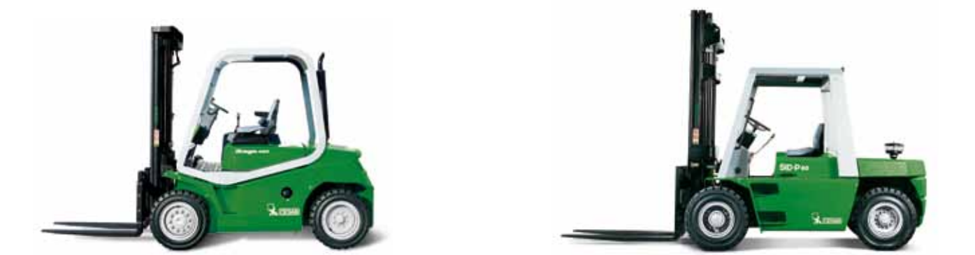
Drago 400 - 450 - 500