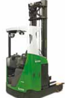
R314 - R316 - R318 - R320 - R325

Also available as a cold store version as well as drive-in version with narrow overhead guard.