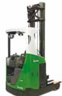
R314 - R316 - R318 - R320 - R325

Also available as a cold store version as well as drive-in version with narrow overhead guard.