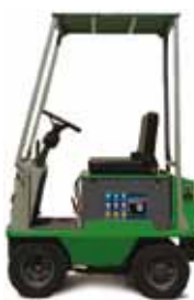
Trac E 50

Also available as a cold store version, with or without heated cabin, as well as a drive-in version with narrow overhead guard.