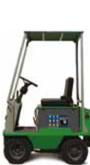
Trac E 50

Also available as a cold store version, with or without heated cabin, as well as a drive-in version with narrow overhead guard.