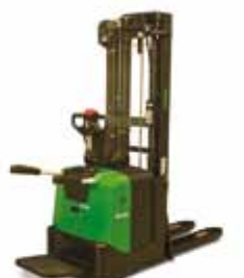
S313L - 316L - 320L